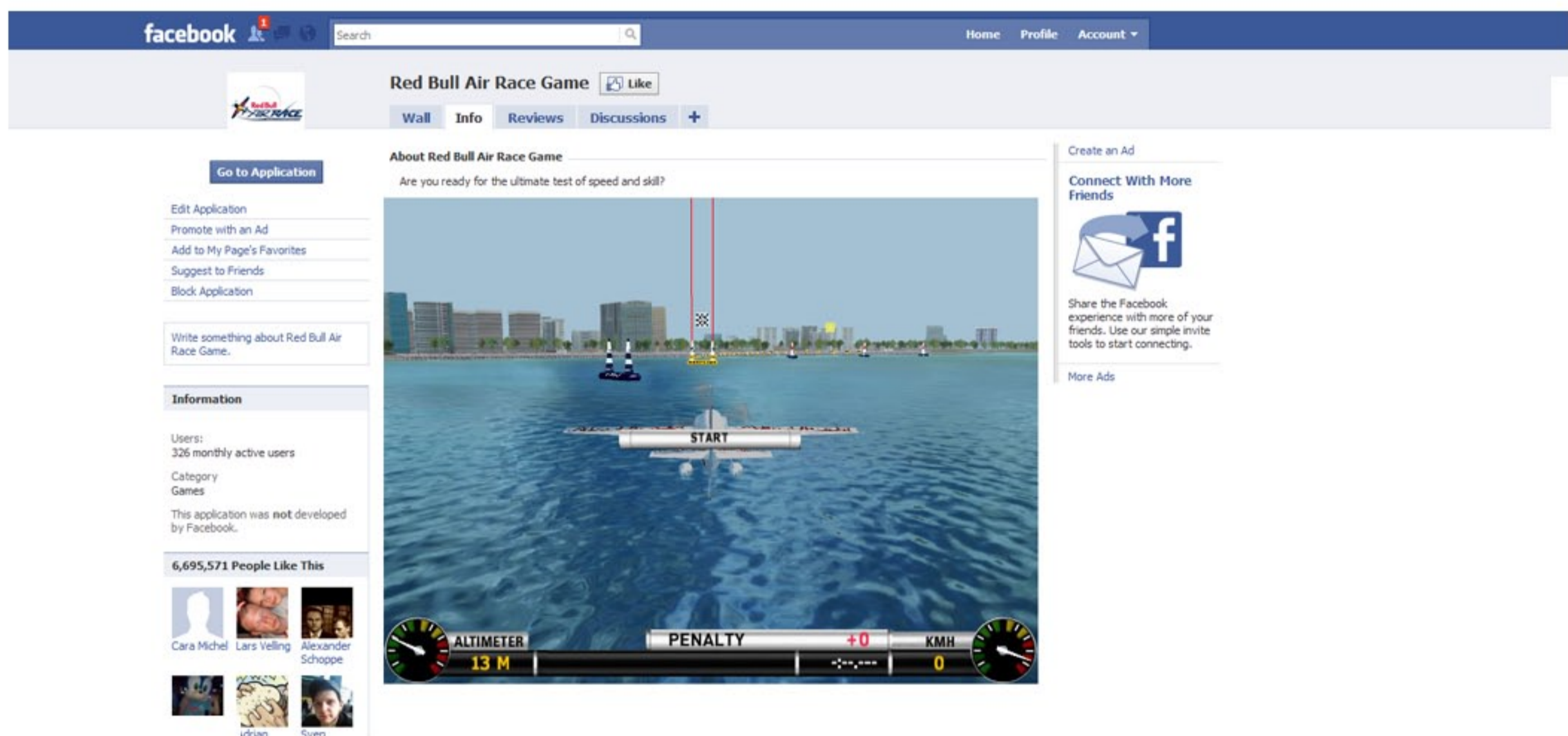
Example: Red Bull Airrace