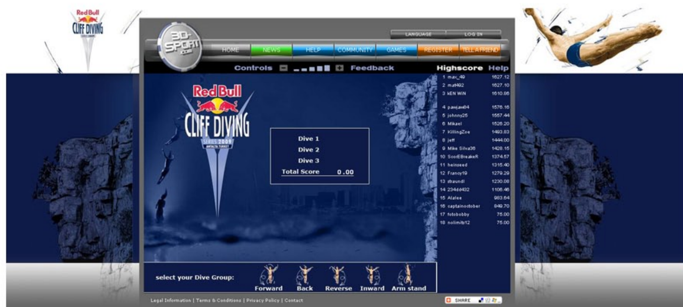
Example: Red Bull Cliff Diving gamee